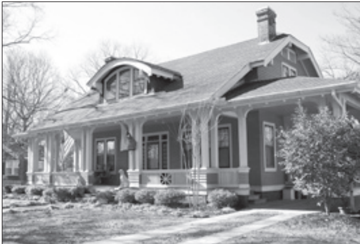
The Mitchell House, a 1923 Craftsman-style bungalow with a distinctive eyebrow dormer, is one of the houses featured on the Hardeman County Homes Tour.

“ The Bills Street Home Tour and Music Festival ” is April 19-20, 2008. It will feature several 19th century homes, the gothic Episcopal Church and Polk Cemetery (burial place of the extended Polk family). Visitors will experience historic architecture, lovely gardens, and will hear fascinating stories of the various owners relayed by costumed docents. On view are original furnishings dating back to the early settling of Hardeman County. Visitors will be able to stroll between sites under the ancient shade trees in this lovely southern neighborhood as they reminisce about bygone days and relive historic events. Homes on the tour include McNeal Place , an elegant, privately owned 1862 French Chateau with original outbuildings; The Columns , a Greek Revival home circa. 1860; APTA’s The Pillars , expanded from a modest brick Federal Style home, circa 1828; and the Maxwell/Bertin House , a 1956 treasure of Chippendale, Hepplewhite and Sheraton furnishings. Tickets may be purchased by mail (APTA, P.O. Box 148, Bolivar, TN 38008) or on the days of the tour. Cost is $20 each. (There is a 10% discount for pre-paid tours of 10 or more.) Children under 12 are free. Phone (731) 518-7148 for information.