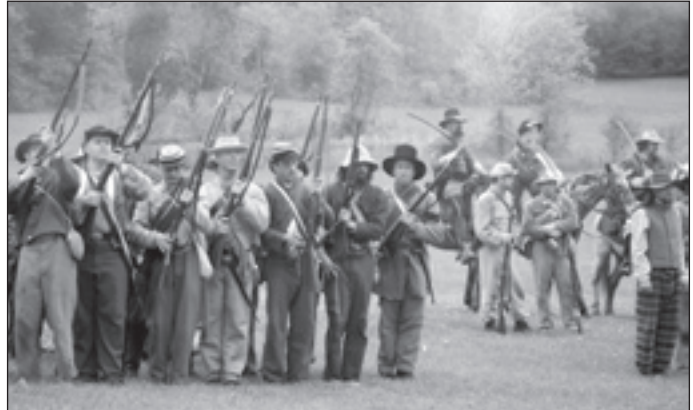
Civil War re-enactors at Ramsey House

Come experience the Civil War with Ramsey House during the Civil War Living History Days on Saturday, April 19, 2007 from 10:00 a.m. - 5:00 p.m. and Sunday, April 20 from 10:00 a.m. - 3:00 p.m. Feel the excitement of live skirmishes, encampments, historic demonstrations, period fashion shows and church services, historic house tours and much more!