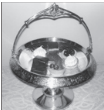
A sweet meat basket from the Woodruff-Fontaine House silver collection.

The “ Silver Linings ” exhibit opens April 2, 2008 at the Woodruff-Fontaine House. On display is the elaborate silver collection of Levin Coe, an educated, colorful attorney in the wild, early years of 19th century Memphis. Included in the collection is river boat silver, candelabras, dinner serving pieces, and Kate Greenaway figures. Summer clothing is on display and the new Textile Room is open to see how fine antique clothing is preserved.