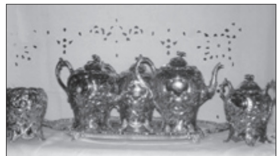
A beautiful silver service owned by Levin Hudson Coe.

The “ Silver Linings ” exhibit opens April 2, 2008 at the Woodruff-Fontaine House. On display is the elaborate silver collection of Levin Coe, an educated, colorful attorney in the wild, early years of 19th century Memphis. Included in the collection is river boat silver, candelabras, dinner serving pieces, and Kate Greenaway figures. Summer clothing is on display and the new Textile Room is open to see how fine antique clothing is preserved.