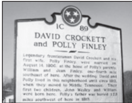
David Crockett and Polly Finley Tennessee Historical Commission marker in Jefferson County