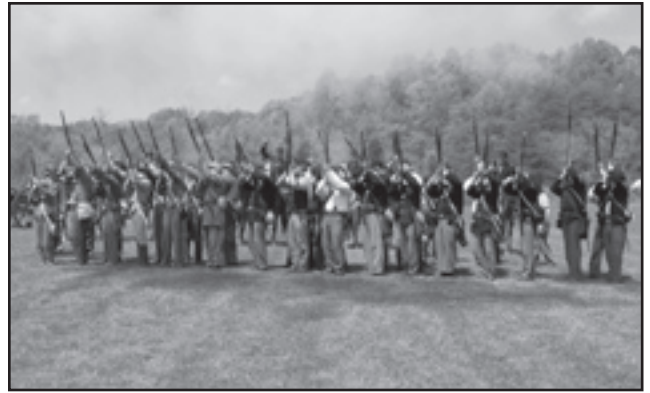
Civil War reenactors at Ramsey House

Come experience the Civil War with Ramsey House during the Civil War Living History Days on Sat., April 14, 2007 from 10:00 a.m. - 5:00 p.m. and Sun., April 15 from 10:00 a.m. - 3:00 p.m. Feel the excitement of live skirmishes, encampments, historic demonstrations, period fashion shows and church ser-