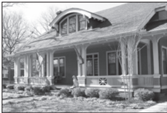
The Mitchell House, a 1923 Craftsman-style bungalow with a distinctive eyebrow dormer, is one of the houses featured on the Hardeman County Homes Tour.