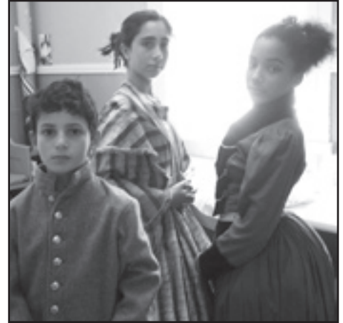
Extreme Theater campers dress up