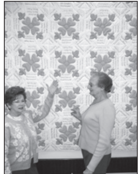
This Community Quilt with 600 names is one of the many quilts to be shown on the Hardeman County Homes Tour.

as the Union headquarters of Gen. Grant and Gen. Sherman; the First Presbyterian Church where Union General Lew Wallace, author of "Ben Hur," worshiped regularly; the Turret (1898), a Queen Anne-style cottage with a distinctive polygonal tower; the Pastorium (1910); the Mitchell House (1923); the Dorris-Chism House (1900), which will feature quilts from the black community; and the Joy-Baker House (1830). Antique cars will be featured along the tour route and a luncheon bistro will be sponsored by the Carl